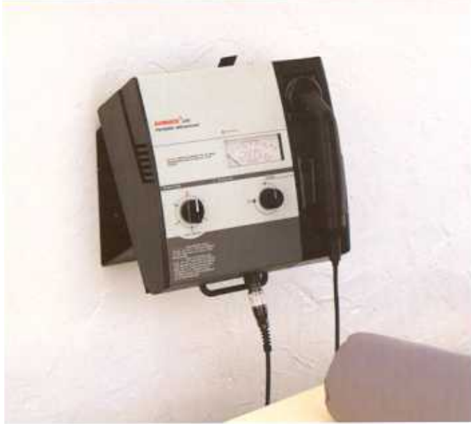
U/20 Portable Ultrasound with optional wall mount bracket